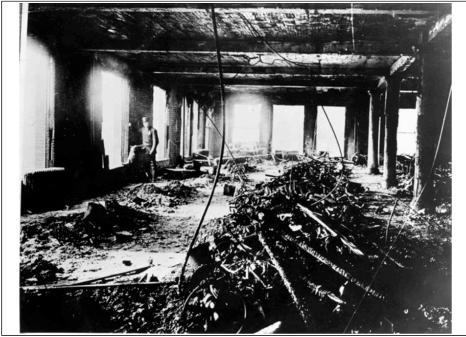
An officer stands at the Asch Building's 9th floor window after the Triangle fire. Sewing machines, drive shafts, and other wreckage of the Triangle factory fire are piled in the center of the blaze-scoured room. Photographer: Brown Brothers, 1911 Kheel Center image identifier: 5780-087pb1f5j