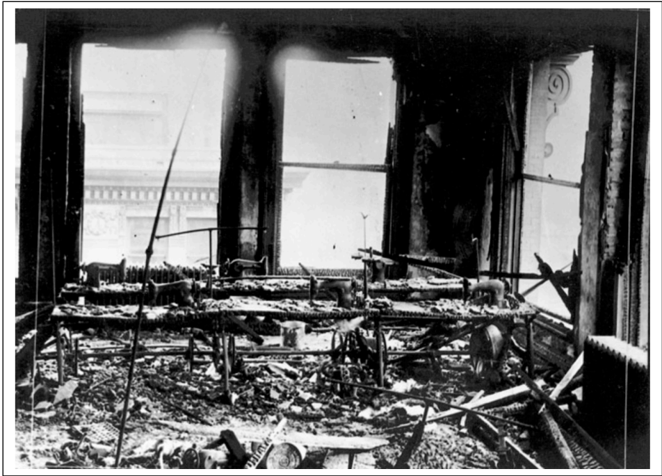
The 240 employees sewing shirtwaists on the ninth floor had their escape blocked by paired sewing machines on 75-foot long tables, back-to-back chairs and work baskets in the aisles. Walking space was so inadequate that many had to waste precious time climbing over tables to get to the stairs, fire escape, elevators and windows that might lead to safety. Photographer: Brown Brothers, 1911 Kheel Center image identifier: 5780Pb39f15g