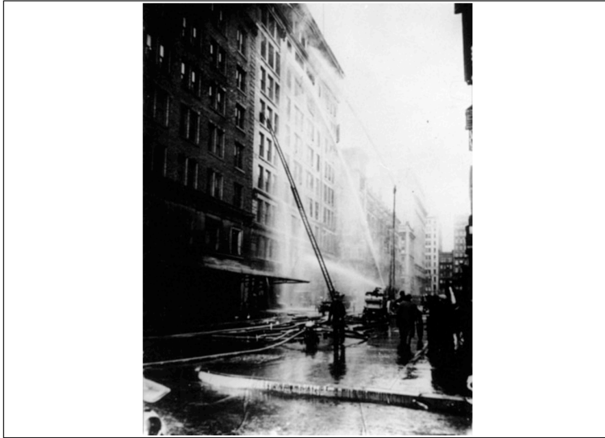
Fire fighters arrived at the Asch Building soon after the alarm was sounded but ladders only reached the sixth floor and the high pressure pumps of the day could not raise the water pressure needed to extinguish the flames on the highest floors of the ten-story building. In this fireproof factory, 146 young men, women, and children lost their lives, and many others were seriously injured. March 25, 1911 Kheel Center image identifier: 5780Pb39f15d