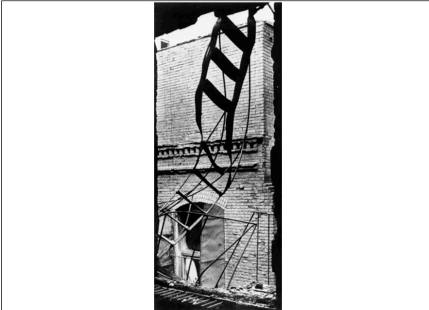
The flimsy fire escape ladder descended close to the building forcing those fleeing to struggle through flames and past warped iron window shutters stuck open across their path. Sections of ladder which ended two stories above the ground, twisted and collapsed under the weight of workers trying to escape the fire killing many who had chosen it as their lifeline. Photographer: unknown, 1911 Kheel Center image identifier: 5780pb39f15a